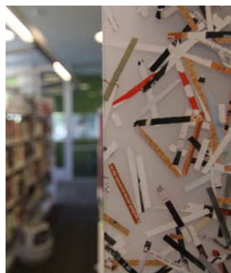
The resin end panels and canopy tops allow for more natural light to flow through the space, and they incorporate recycled content.