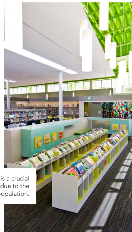
The Children's area is a crucial department in this library, due to the large youth population.