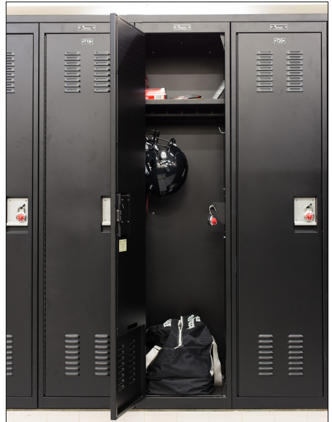
Well-appointed interiors with plenty of room for equipment and personal gear

Custom lockers from Spacesaver provided the perfect solution: they were within the project budget and they checked off every item on the school's list. Two years after installation the athletic director reported that there hasn't been a single theft or mechanical issue. The new locker room is spacious and secure, providing coaches and student athletes with the space they need to stay organized for years to come.