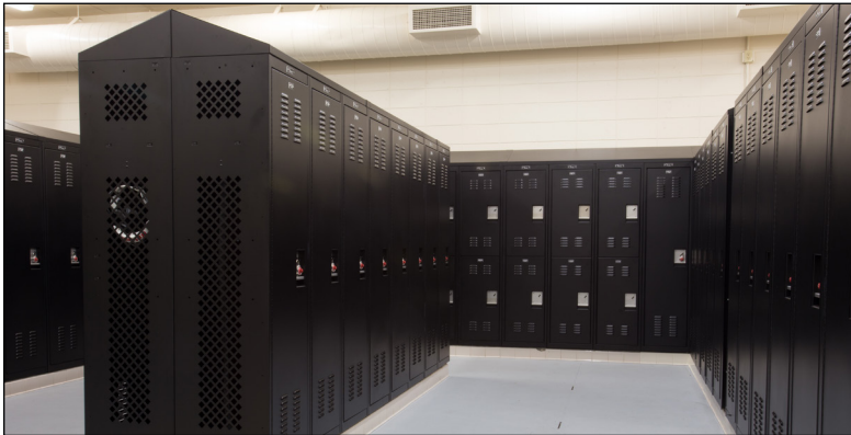
Sturdy storage in full-height and half-height lockers, with louvers and perforations for ventilation

The school wanted to invest in more durable lockers so coaches could focus on developing athletes rather than investigating thefts. The project planning team had other requests, too: they wanted full-height lockers for varsity players and half-height for JV, and they wanted all the lockers to look similar so the locker room would have a cohesive appearance. Preventing odor build-up was another top priority, so they requested lockers with louvered doors and ventilated panels on the sides.