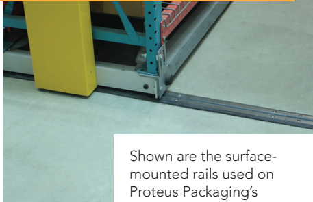
Shown are the surface-mounted rails used on Proteus Packaging's ActivRAC system.